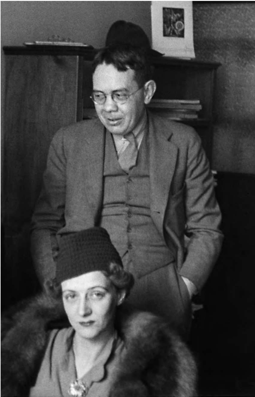
Bernard DeVoto, of Ogden, Utah, and Avis, of Houghton, Michigan, were a shocking, outspoken, and stylish couple in the Harvard University community in Cambridge, Massachusetts, in the late 1920s and 1930s.