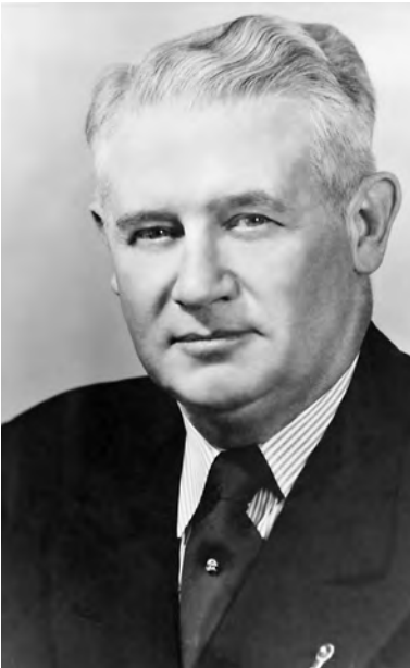
Wyoming Senator Lester Hunt.

Bernard's 1950 Saturday Evening Post article "Shall We Let Them Ruin Our National Parks?" fought to keep the Echo Park Dam out of Dinosaur National Monument and launched a "whitewater navy" of rafters on Utah's Green River.