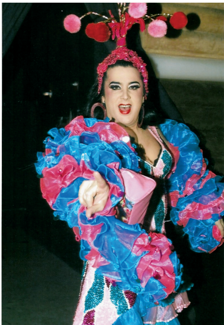
Perfidia PAT'S COLLECTION