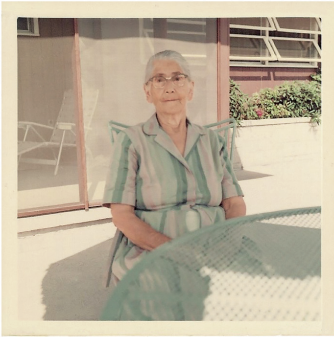
Sultana PAT'S COLLECTION