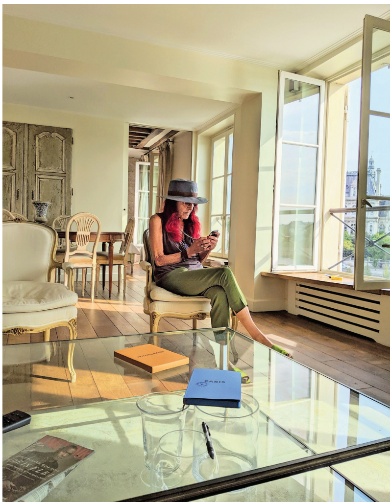
In my apartment on the Île de la Cité PAT'S COLLECTION