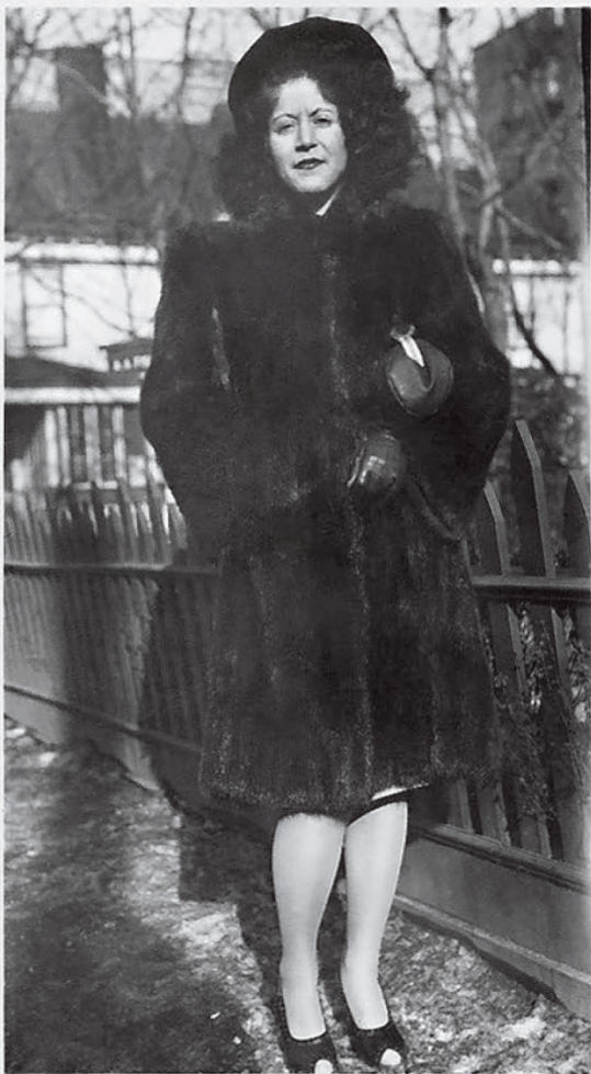
Aunt Van PAT'S COLLECTION