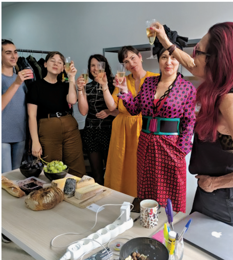
With my Parisian team during one of our champagne Fridays PAT'S COLLECTION