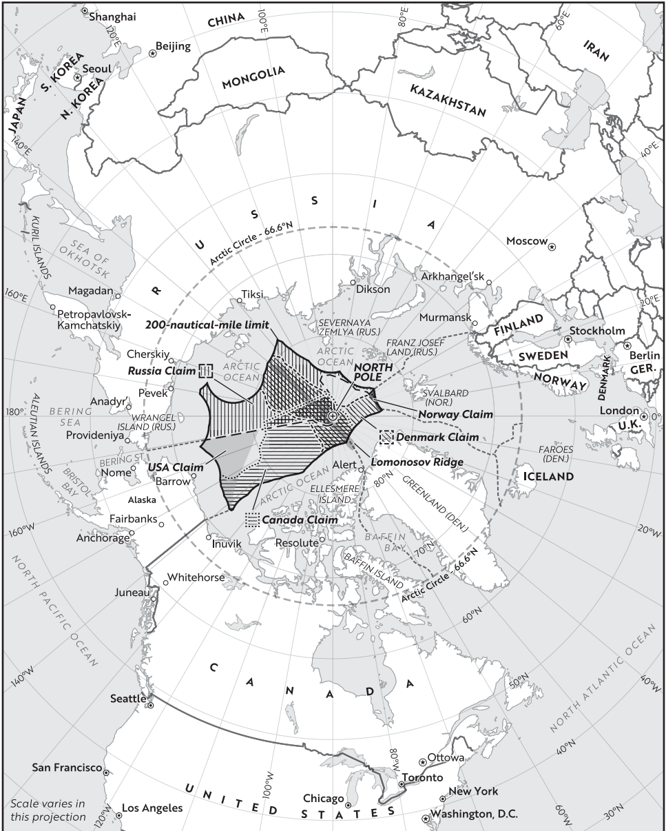
Arctic claims source: IBRU, Durham University Map copyright © 2020 Springer Cartographics LLC