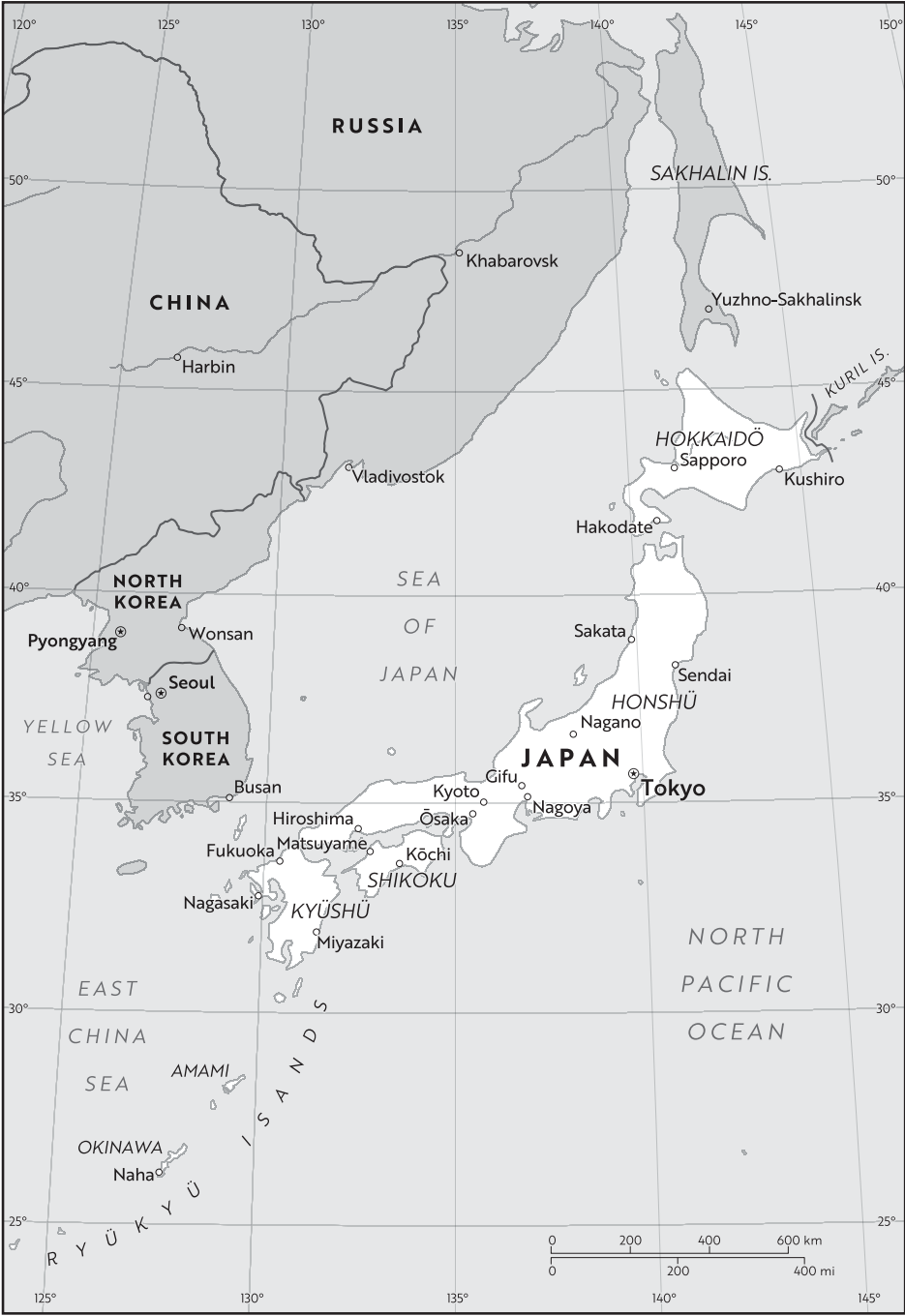
Map copyright © 2020 Springer Cartographics LLC